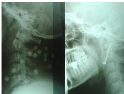
Figure 2. Pre and post operation imaging of 28 years old woman with traumatic odontoid fracture

incomplete quadriplegia of grade 2/5 motor power and 3 cases with grade 3/5 motor power. In one case, there was complete paraplegia due to T2-T3 fracture and dislocation. In other cases, there was no motor deficit. Eleven patients had associated severe head injury. Brain CT was also performed to exclude associated head injury (Figure 2).